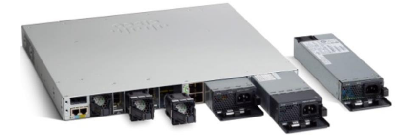
Table 3 lists the different power supplies available in these switches and available PoE power.